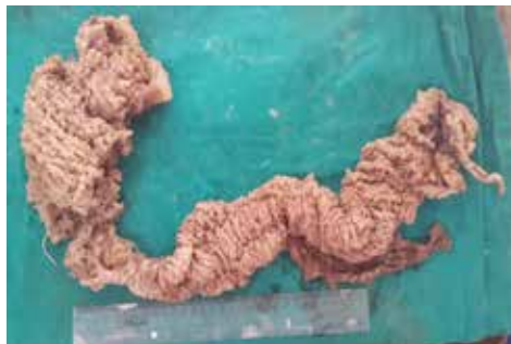
Fig-2 Gross specimen showing multiple sessile polyp and growth