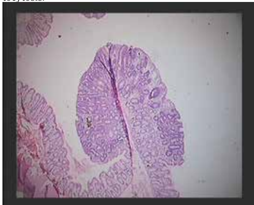
Fig-3 showing adenomatous polyp with mild to moderate dysplasia ; H&E(5X)

Lymph node resected shows reactive hyperplasia and sinus histiocytosis.