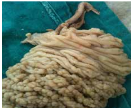
Fig-1 Gross specimen of cecum with colonic polyp